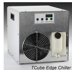
TCube Edge Chiller