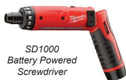
SD1000 Battery Powered Screwdriver